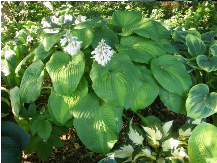
Five O'Clock Somewhere