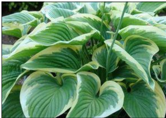
2015 Hosta of the Year 'Victory'