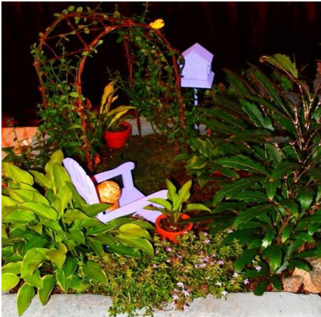
Hosta shows feature dish gardens, some with fairy furniture.

'Fairy Frolic', 'Woodland Elf' and 'Little One', to name a few. I'm sure they all shed 'Tiny Tears'. Other perennial classifications show similar infatuation. Though not outwardly obvious, many retain names based on fairies, such as foxglove. Etymologists, who like me study words, say "fox" was a corruption of "folk's" and the flower resembled a thimble or finger-stall, hence "glove." One old-timey name for foxglove was "bloody fingers."