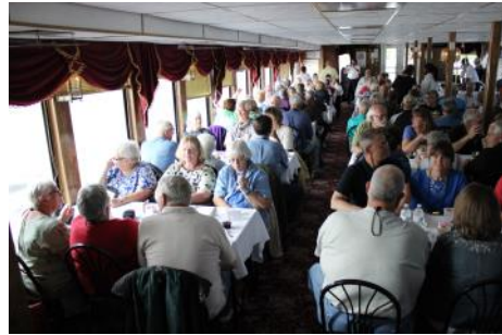
Spirit of Dubuque