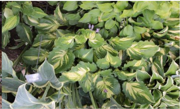
H. 'Lakeside Paisley Print'