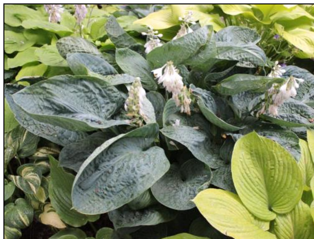
H. 'Unruly Troll'