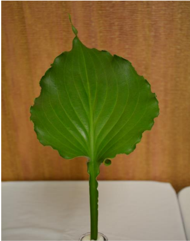
Best of Show—The Fonz, Jim O'Donnell