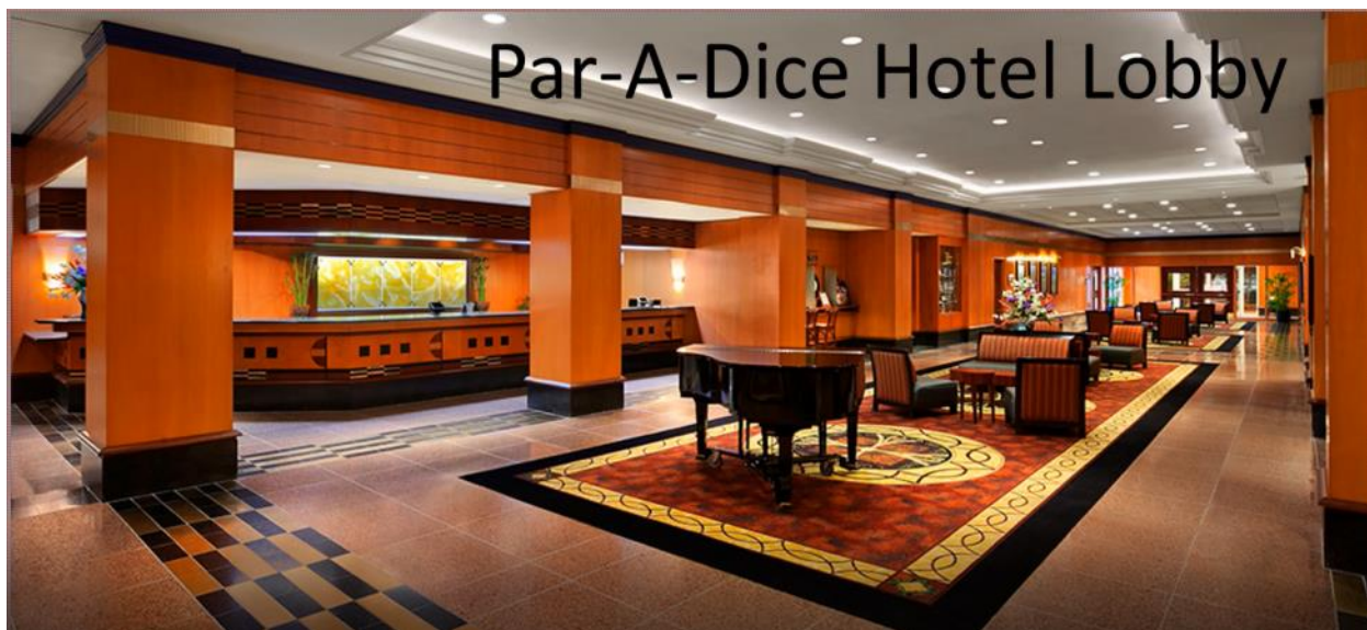
Par-A-Dice Hotel Lobby

Meet up with old friends & Make new ones