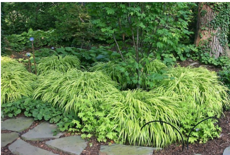
Hakonechloa macro 'Aureola'