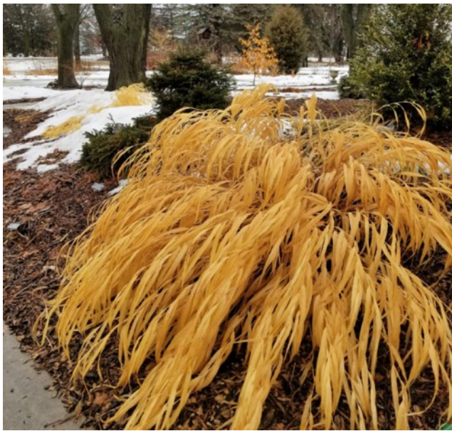
Hakonechloa macrocarpa 'Albo-striata' showing its golden winter color

Whether you garden in sun or shade, grasses should be part of your plant palette. Though more grasses prefer sun than shade, Japanese Forest Grass will make you glad that you garden in the shadows. Even during a Wisconsin winter, it provides textural and color interest. Look for Japanese Forest Grass cultivars in the catalogs that will soon arrive in your mailbox and at garden centers next spring.