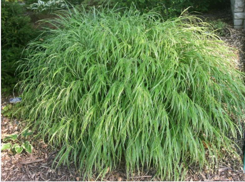
Hakonechloa macro 'Albo-striata'