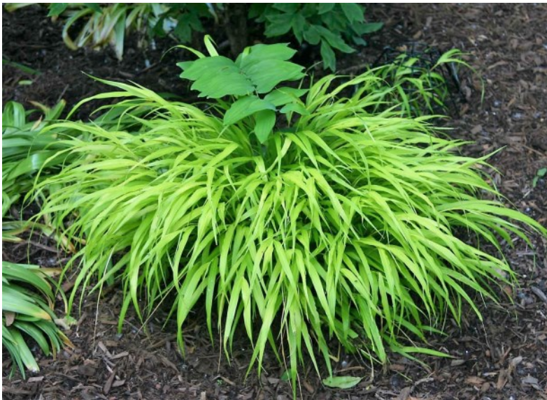
Hakonechloa macro 'All Gold'