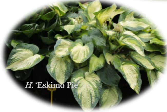
H. 'Eskimo Pie'