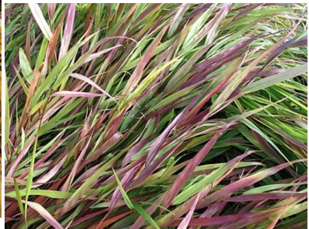
Hakonechloa macrocarpa 'Beni Kaze' foliage