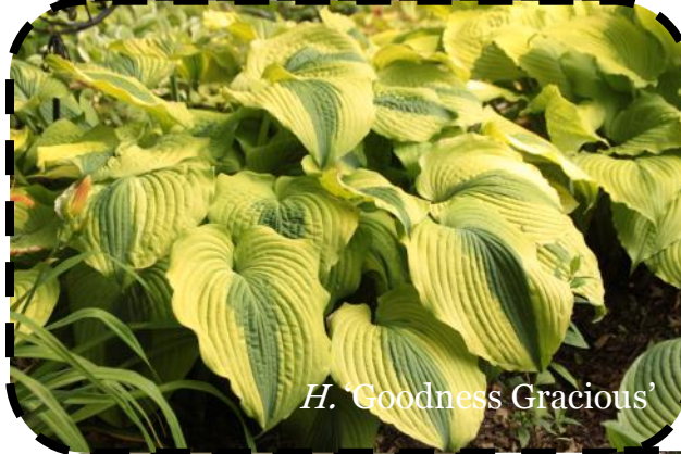
H. 'Goodness Gracious'