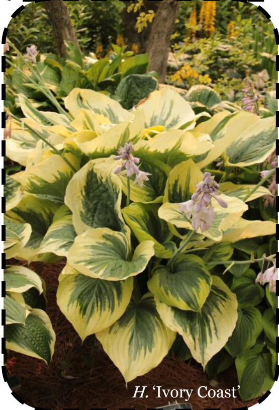
H. 'Ivory Coast'