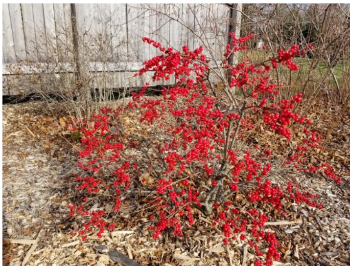
Ilex verticillata 'Red Sprite' (Winterberry Holly)

This native is deciduous, rather than evergreen like most hollies. Distributed throughout our state, it can reach heights of 10 feet or more, though the cultivar 'Red Sprite' (also known as 'Nana') tops out at a compact 4 feet. Hollies have separate male and female plants, so be sure to plant both sexes in order to obtain the colorful fruit. These berries are loved by birds; expect to see flocks of our winged friends to pick the plants clean before winter ends.