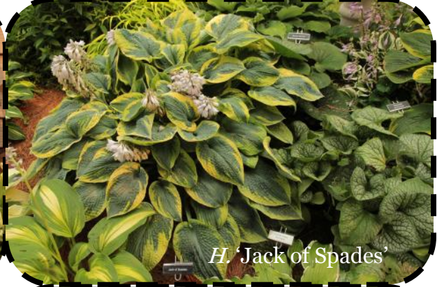
H. 'Jack of Spades'