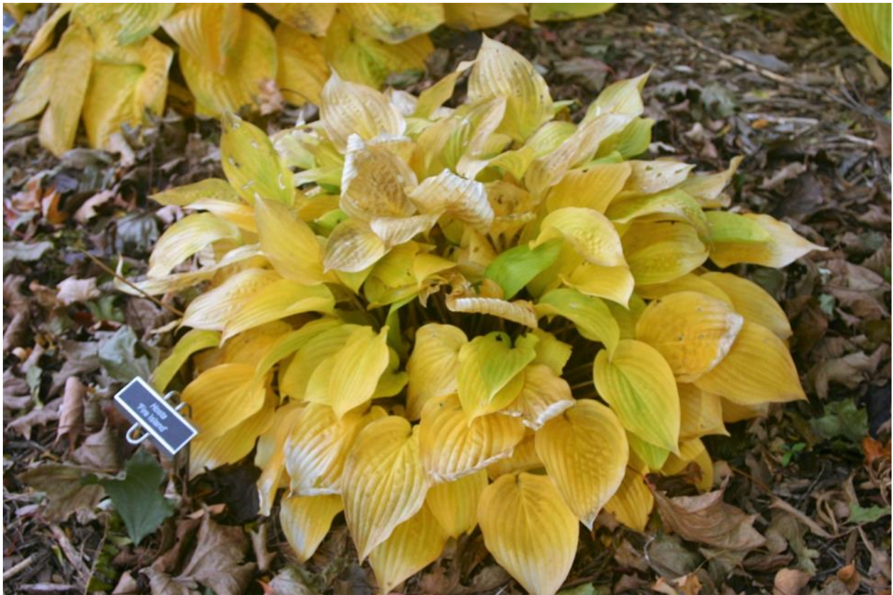
Hosta 'Fire Island' in fall