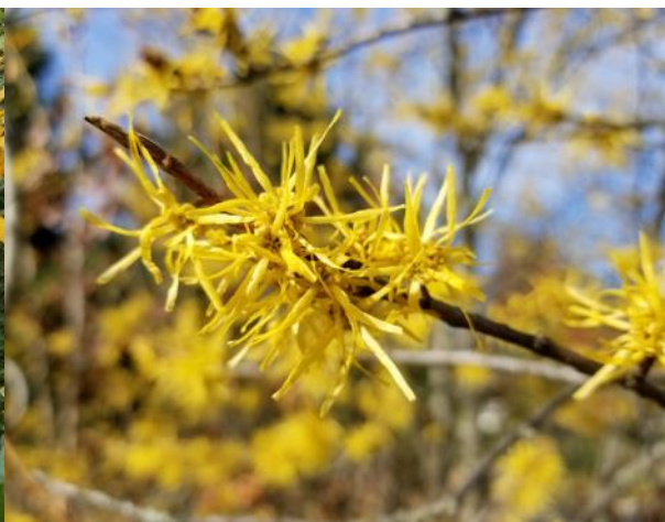
Hamamelis virginiana (Witchhazel), Fall color Hamamelis virginiana flowers