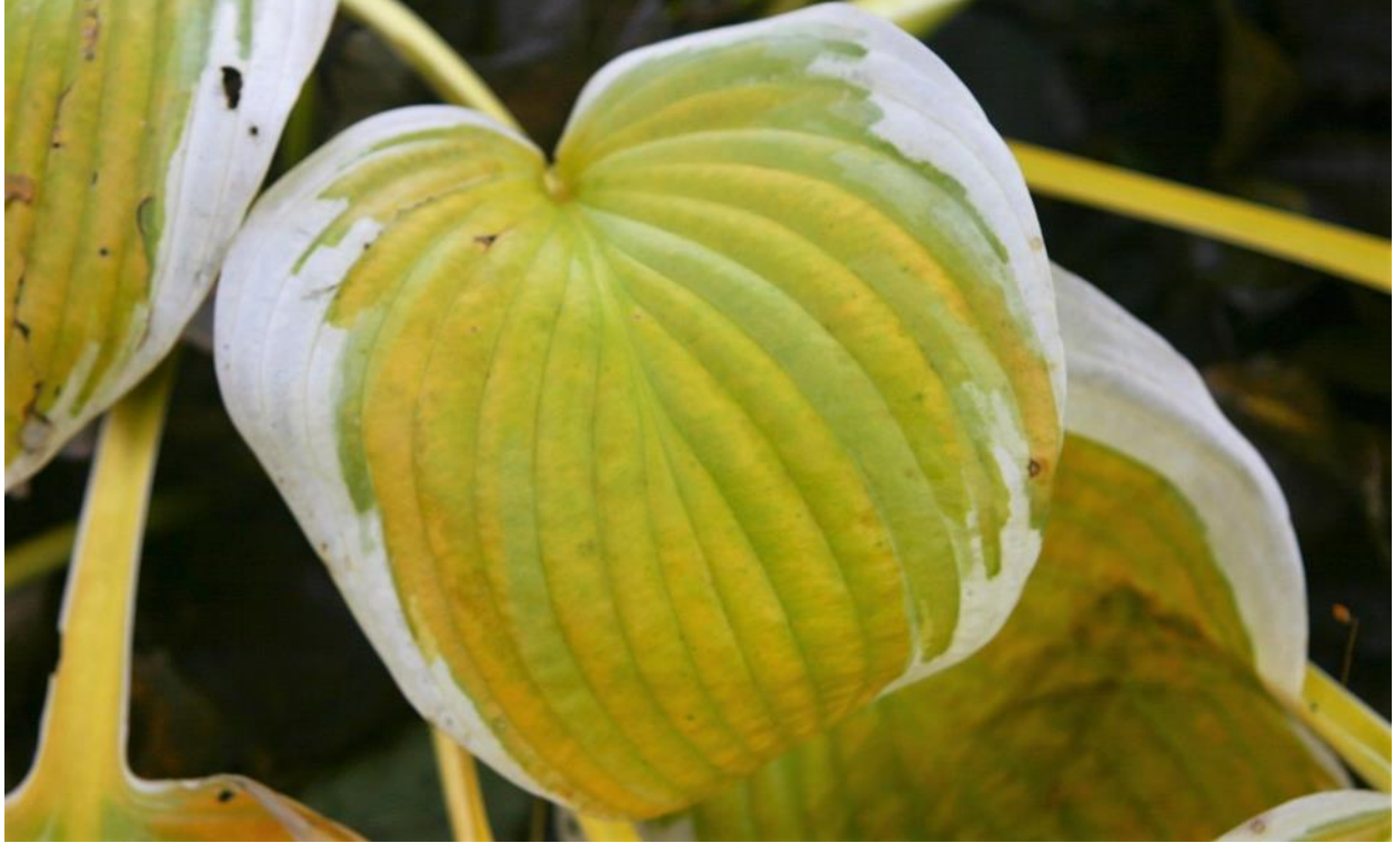
Hosta 'Dragon of the Seas' in fall