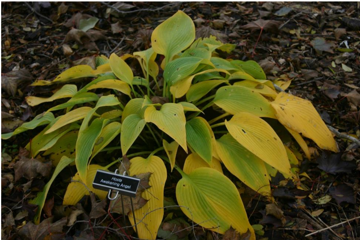
Hosta 'Awakening Angel' in fall

We usually don't think of herbaceous perennials when we discuss fall colors, but my front yard shade garden is a sea of yellow when the hostas lose their green pigments. For this reason alone, I wait until a hard freeze turns the leaves to mush before I clean up my beds.