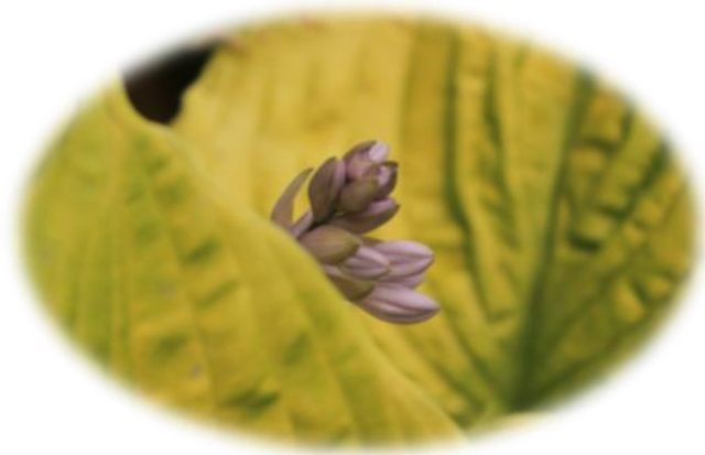
H. 'Coast to Coast'