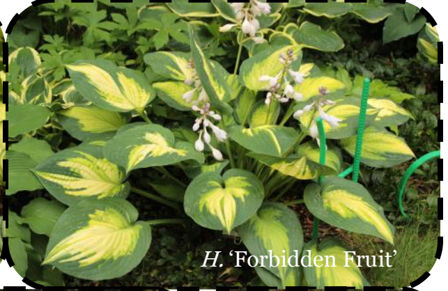
H. 'Forbidden Fruit'